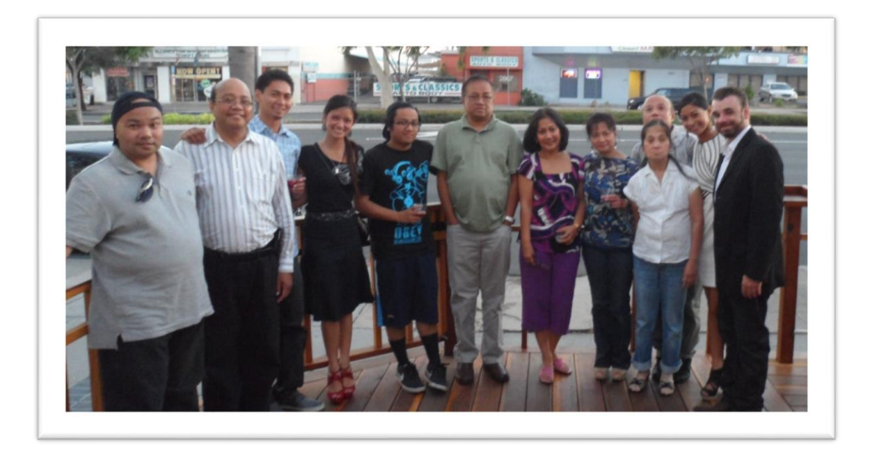
Scenes from the Grand Opening Party of the SD Soup Shoppe, October 2012 It is the hopes of this Action Learning Handbook that there will be one for the SD Soup Truck as well!