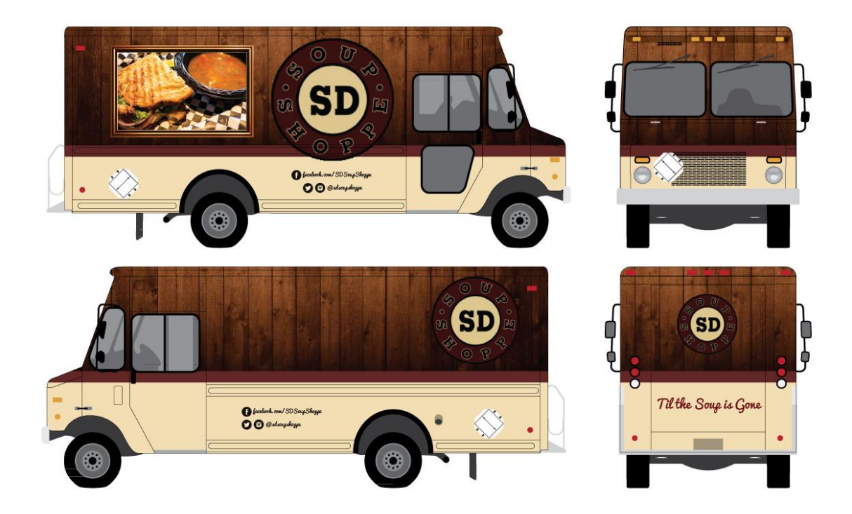
SD Soup Truck mock-up is courtesy of Tim Borillo, web designer and developer for www.sdsoupshoppe.com. Mock-up is hypothetical and not official.

Who recognized the parties involved, from those existing to those that will need to be brought on board. What evaluated the look of the food truck, what it would sell, as well as its social media. Where and When gauged the location and schedule prospects, and Why finally wrapped all of the meaning together and stated the reasons for the SD Soup Truck. The variety of aspects may represent only the start of the planning, but it is clear that the more thorough the analysis, the better view of what is likely to happen.