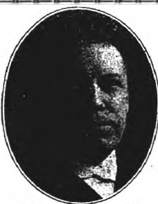
General Supt. Goodwin

send a shout of victory that will make the angels rejoice and start an epoch of greater revivals in all lands.