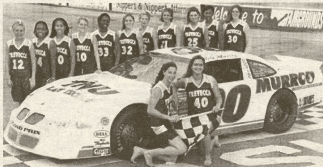
The 2002-03 Lady Trojans prepare for another successful season.