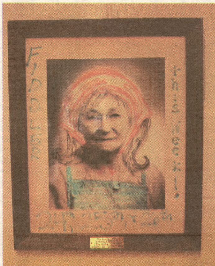
Johnson Dorm mascot "Sadie" shows off her most recent decor.