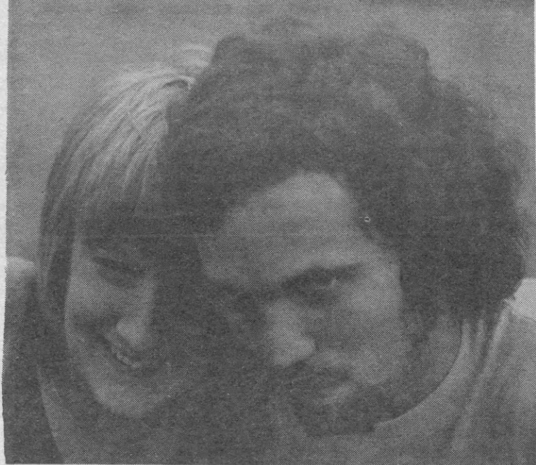
Happy faces are all you'll see at the Spring Fling (we hope!)

Encounters is the official traveling musical group of the public relations department of TNC.