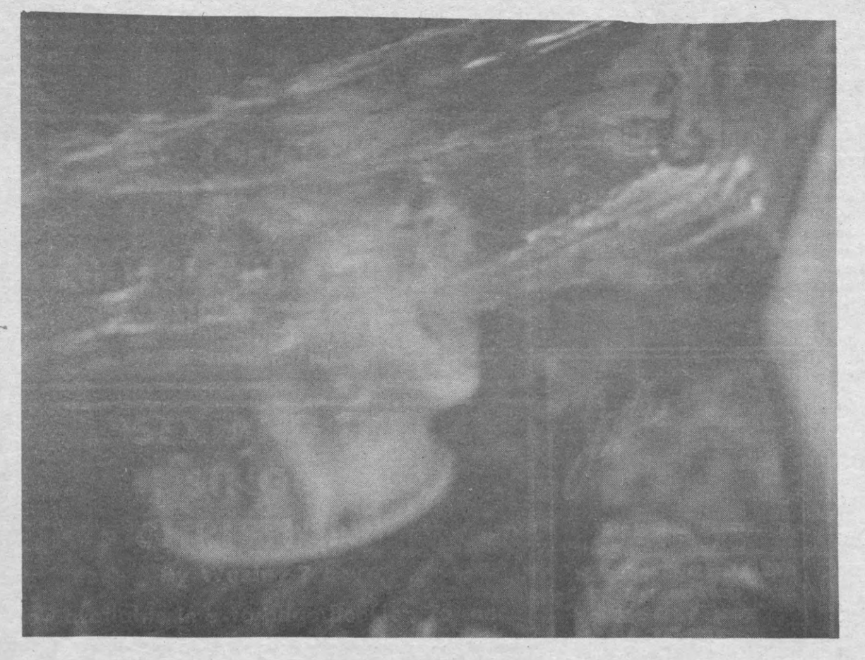
A Drink of H2O?

You liked "Thurber Carnival;" you loved "Viet Rock": so you certainly won't want to miss this!