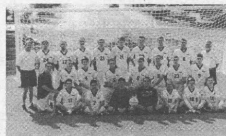
The Men's soccer team also added a win to their season. The Trevecca guys defeated Asbury 2-1.