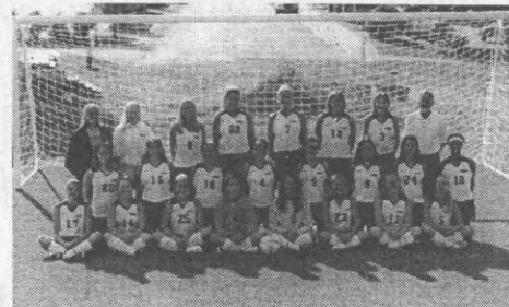
The Lady Trojans won their 7th game of the season on Oct. 27 against Asbury College. The final score was 2-1.